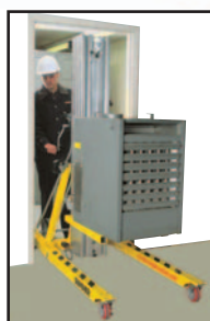
Fits through doorways!

Using plunger pins, forks remove and reverse easily for added height or to get flush with a ceiling. No loose pieces!